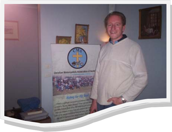
CMA UK Visitor